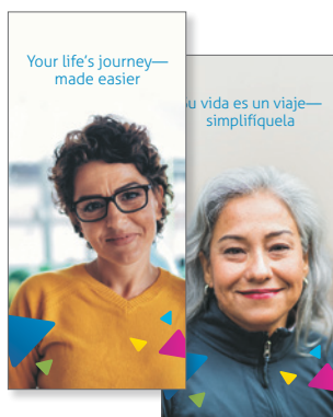
Brochure with wallet cards

We offer a comprehensive selection of materials to educate your staff about their program. All communications are available in English and Spanish and most of the materials are co-branded with a custom imprint featuring your program name, logo and contact information.