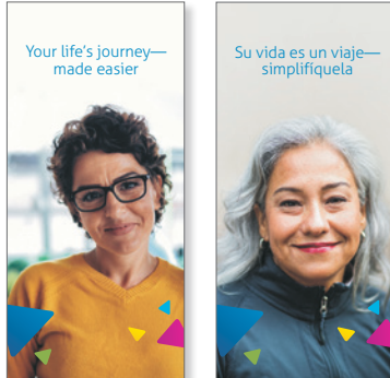
Brochure with wallet cards

We offer a comprehensive selection of materials to educate your staff about their program. All communications are available in English and Spanish and most of the materials are co-branded with your program name, logo and contact information.